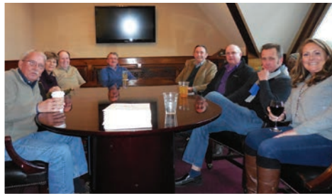
AAC Membership Ambassadors

Recently, an invitation was posted to Clubster seeking persons interested in participating in such a program. The response was fantastic and as a result, a number of individuals have stepped forward to volunteer their time to help in the continued development of the Membership Ambassador Program, at the membership level. The expectation is for these Membership Ambassadors to become effective advocates of AAC working together to genuinely make prospective and new members feel a warm welcome when visiting the Club.